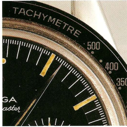
Bezel Diameter 40mm, Case Diameter 40mm CK2998-ST105003 (1959-1966)