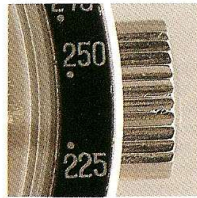
7mm Diameter CK2998-ST105012 (1959-1967)