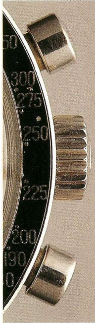
5mm Diameter ST105003- (1962-)

Omega used a 4mm diameter push button up until the second model, the same push button it was already using in the Seamaster chronograph. The addition of an O-ring for greater ease of use resulted in the increase in diameter.