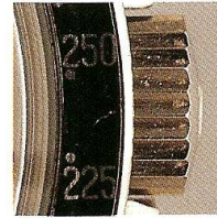
6.5mm Diameter ST145012- (1966-)

Omega started by using the same small-diameter winding crown as in the Seamaster chronograph, but here, too, the addition of an O-ring resulted in an increased diameter to 7mm. Later, Omega installed a guard integral with the case, which reduced the diameter slightly, to 6.5mm.